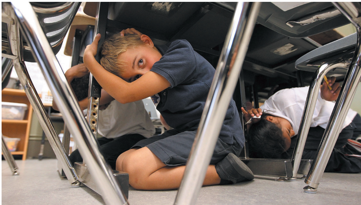
US school children shelter under their desks during an earthquake drill.