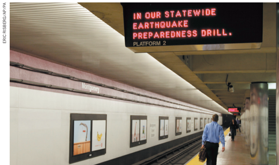
An earthquake early-warning drill at a Bay Area Rapid Transit station in California.

In California, the Bay Area Rapid Transit system has implemented an automated train-braking mechanism that is triggered by earthquake early warnings. It takes 24 seconds to bring a train travelling at 112 kilometres per hour (70 miles per hour) to a stop. During peak commuting times, about 64 trains are in operation, each carrying around 1,000 passengers, and up to 45 trains travel at 112 kilometres per hour at any one time. Even one derailment at such a speed would be devastating.