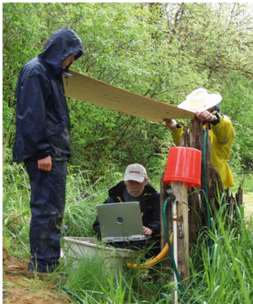
-Working in the rain takes a team effort!